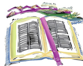
NATIONAL BIBLE WEEK

National Bible Week is a longstanding American tradition that celebrates the enduring influence of the Bible in personal and public life. Its origins date back to 1941 during a time of global unrest and uncertainty as World War II loomed. The initiative was spearheaded by the National Bible Association, a group formed in 1940 by business and professional leaders in New York City who believed in the Bible's power to offer hope and guidance during difficult times.